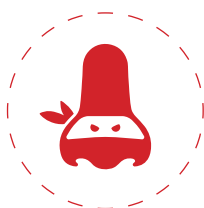
Scent Ninja your nose/hay fever

Hay fever can make your asthma worse. Make sure you are prepared to combat this villain. It can attack at any time of the year in different forms e.g. pollen, cats, strong smells.