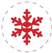
Master Evil Chill cold air

Best weapon: Ask your Asthma Master about using your blue puffer before exercise.