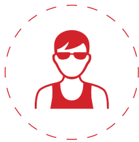
Agent Breathless exercise

Best weapon: Get your flu vaccination around April.